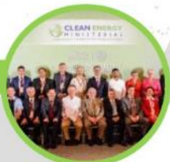
CEM6 - 2015 Mexico