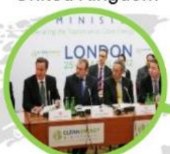
CEM3 - 2012 United Kingdom