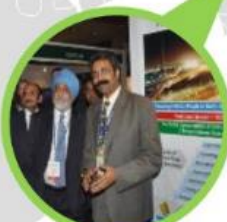
CEM4 - 2013 India