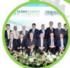
CEM7 - 2016 United States