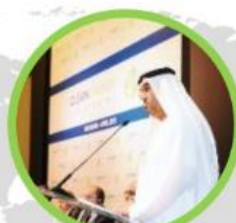
CEM2 - 2011 United Arab Emirates