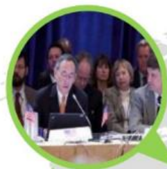
CEM1 - 2010 United States