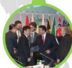
CEM5 - 2014 Korea