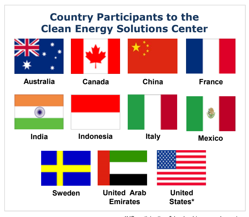
*US participation & leadership are under review.